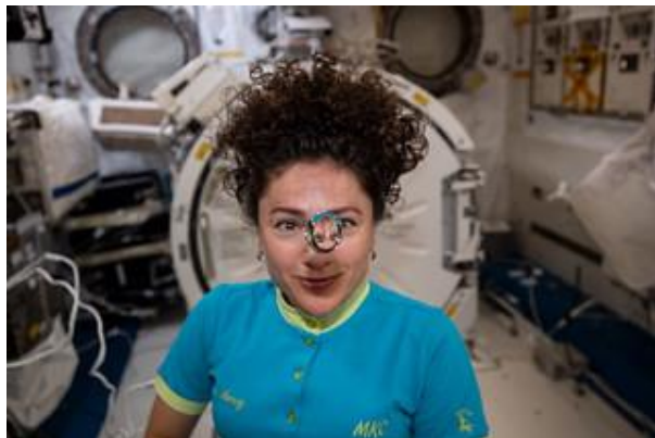
The astronaut Jessica Meir observes a floating sphere of water.

So, next time you enjoy one of these rides you can feel like an astronaut for few instants! Another way scientists can study microgravity is by simulating it. They can use special devices (e.g.; clinostats) in which constant rotations are applied to samples in such a manner that gravity, although always present, is counterbalanced and neutralised.